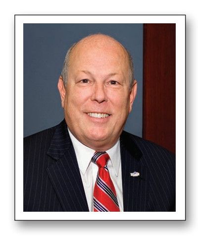
Note from the President

The year 2008 proved to be a monumental one for the US economy, the credit union industry and USAlliance. The economy retreated into a recession the likes of which have not been felt since the early 1980s. While the credit union industry as a whole has weathered the economic storm better than its banking counterpart, it has not been totally immune to the downturn. For USAlliance, it was a year of both challenges and opportunities. We implemented actions to mitigate the former while initiating others to seize upon the latter. The decisions made were sound, prudent ones to help position the Credit Union to better compete in the future. Steps taken by us to insure a more prosperous tomorrow, as well as extraneous events and proper accounting requirements, have had a negative impact on our current financial position, resulting in a non-operational loss. I'd like to address each of these in more detail.